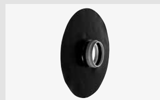
HKD slip-on flange