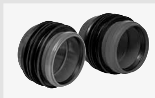
HKD KG / KG2000 double socket