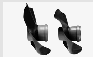
HKD KG / KG2000 plug-in flange