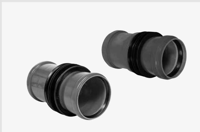
HKD KG wall element / HKD KG2000 wall element